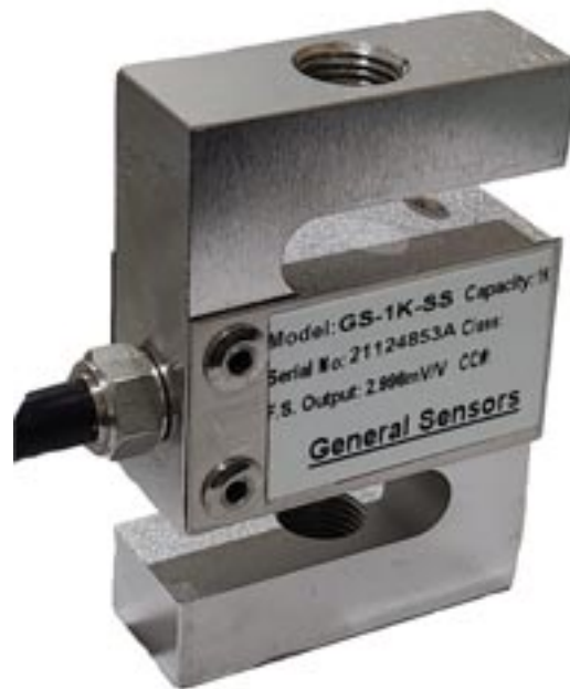
General Sensor GS-SS